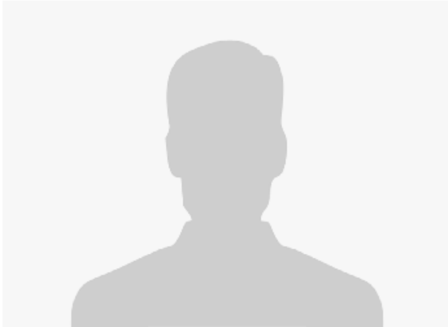
Motivational Value System

I am motivated by flexibility and adapting to others or situations. I have a strong desire to collaborate with others and to remain open to different options and viewpoints.